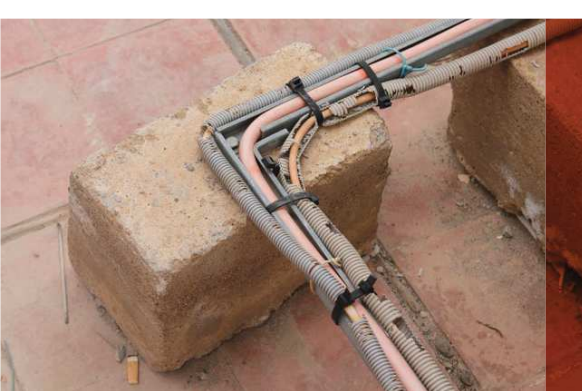
Wires on the solar panel plant corroded due to extreme heat

To reduce water consumption, new water-efficient low-flow plumbing fixtures have been installed. While the older toilets used between 20 to 25 litres of water each flush, this new system uses only six litres per flush.