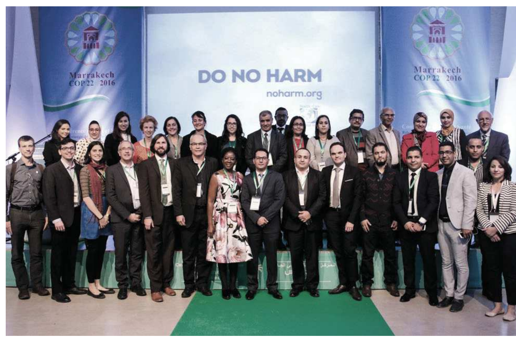
Climate and Health Care Conference participants at CHU Mohammed VI, December 2016

In December 2015, CHU Mohammed VI participated in the Conference on Climate Change and Healthcare at the European Hospital Georges Pompidou in Paris, held in parallel with the Paris UN climate change meeting (COP21). CHU then went on to host the Climate and Health Care Conference in parallel to COP22 in Marrakesh in 2016. The event brought together health sector leaders from Morocco, Europe, and beyond to share strategies for the health sector to mitigate its own climate impacts, develop low carbon models of care, and use their voice, both individually and collectively, to advocate for policies to address climate change and public health.